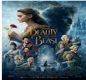
Poster for Beauty and the Beast